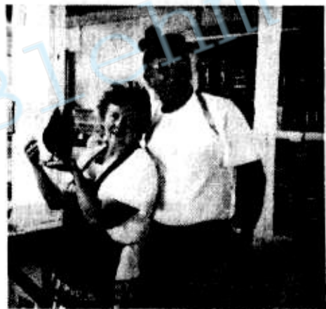
MONTANA STATE FAIR SHOW #2